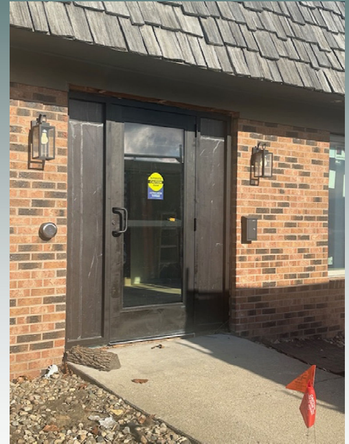
The Clay Outreach Office